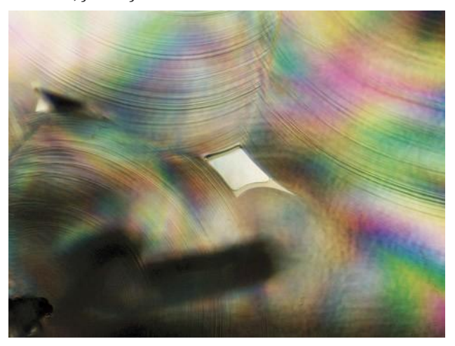
Figure 14. This fluid inclusion contains mostly a gaseous phase. It is trapped at the intersection of curved botryoidal growth zones and presents high-order interference colors obvious between crossed polarizers. field of view 1 mm.

Between crossed polarizers, high-order interference colors were observed (figure 14), as expected for this gem. This is due to anomalous birefringence linked with the strain present between the curved growth layers of hyalite. Also, a fluid inclusion was observed in the intersection of the botryoids (again, see figure 14). This inclusion is composed mostly of gas, suggesting that this hyalite was deposited from a gaseous phase. Although some of these features have been previously observed in hyalite, it is rare to see them all in the same sample. To the best of our knowledge, this is the first reporting of pronounced cubic cavities in hyalite.