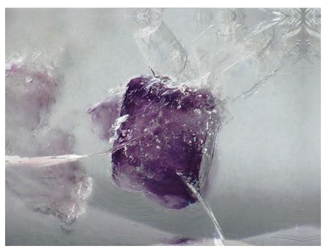
Figure 12. Purple fluorite cube, identified by micro-Raman spectroscopy, in a hyalite. field of view 1.2 mm.

The Laboratoire Français de Gemmologie (LFG) received for analysis a 1.83 ct hyalite, also known as opal-AN: an amorphous (A) opal containing hydrated silica molecules that are network forming (N) (E. Fritsch et al., "Green-luminescing hyalite opal from Mexico," Journal of Gemmology , Vol. 34, No. 5, 2015, pp. 490–508). This is one of the rarest varieties of gem-quality opal. The gem fluoresced green under long-wave ultraviolet (365 nm) and, with more intensity, under short-wave UV (254 nm), due to U6+ in the form of uranyl (UO2)2+ (E. Gaillou et al., "Luminescence of gem opals: A review of intrinsic and extrinsic emission," Australian Gemmologist, Vol. 24, No. 8, 2011, pp. 200–201). A purple fluorite (identified by a micro-Raman spectrometer; figure 12) and a series of cube-shaped cavities were visible (figure 13) in the hyalite, which appear to be all interconnected. Sometimes these cavities also contain small crystals of fluorite relics detected by Raman. Thus, these cavities may be the result of the partial dissolution of fluorite crystals. This would explain their cubic morphology, which cannot be explained by the dissolution of amorphous hyalite.