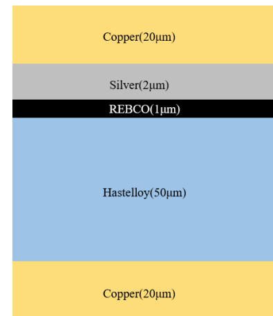
Fig. 1. Cross-section of REBCO HTS tape

different practical applications, structural deformation including tensile, shear, torsion, bending, and delamination may occur in the production, processing, and operation of superconducting tape [4][5]. In the above deformation mode, the superconducting tape will have a certain critical current recession. In general, the irreversible strain of the REBCO layer can only reach 0.45 %. Since the residual strain of the REBCO super-conducting layer can reach -0.237% when cooling it to 77K, the strain of recession point can reach 0.7 %. Moreover, the critical current density of the superconducting tape will quickly decay to 0 after the plastic yield happens [6]