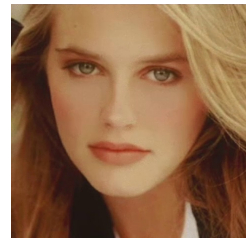
Filter: Glam grain