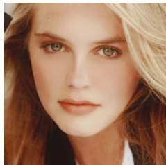
Filter: Relax! You Pretty!