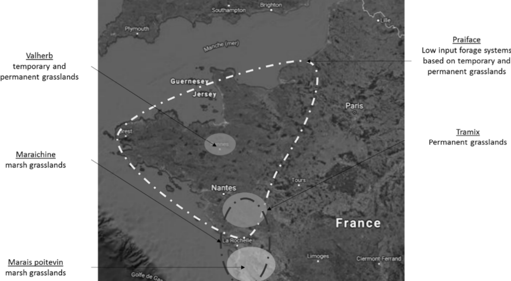
Figure 1. Studies areas for each project and type of grasslands studied.