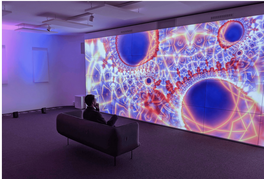
Fig. 3. Illustration of the immersive Cube.

The Lef  vre-Utile (LU) company 1 , famous for its Petit Beurre (also called V  ritable Petit Beurre ) biscuits, was founded in Nantes in 1846. In the 1910s, LU employed 1,200 workers and produced over 6,000 tons of biscuits. The Petit Beurre fragrance is thus diffused in an immersive "Cube", in which the experience takes place, with a view to invite participants to an olfactive journey. The Cube, represented on Figure 3, is a seventy square metre room with spatialised sound, as well as with a whole stretch of wall composed of immersive screens, which can be used for many experiments and experiences related to digital immersion, like artistic exhibitions or virtual reality testing.