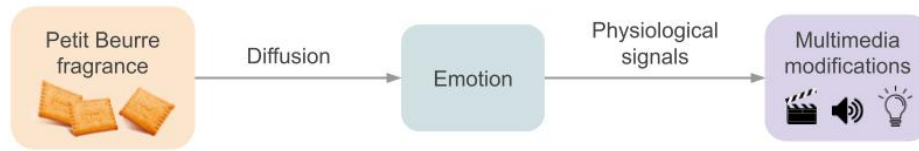
Fig. 2. Illustration of the conduct of the experience.