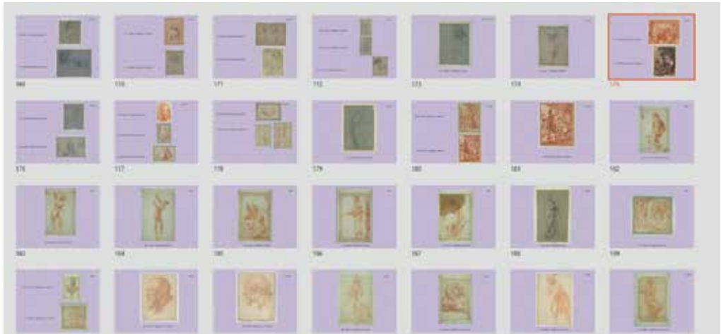
5. Digital reconstruction of Baldinucci's volume 3, detail

as being originals 31 . However, some copies can be seen as an evidence of Baldinucci's profound connoisseurship, like the Study of young man 32 , that he attributed to Pontormo (1494-1557), possibly inspired by a sculpture by Michelangelo (1475-1564). Although the attribution to Pontormo is no longer accepted, Janet Cox Rearick suggested in 1965 that the graphic work might be an early one by Empoli imitating Pontormo 33 . This hypothesis not only endorses Baldinucci's good eye in catching the high quality of the sheet but also recalls what he wrote about Empoli in his Notizie , i.e. the fact that he spent a lot of time in copying ancient masters' compositions during his apprenticeship 34 .