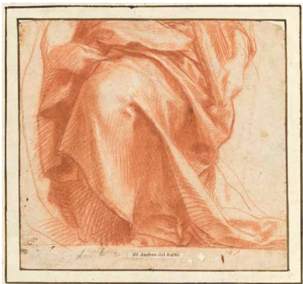
4. Andrea del Sarto, Drapery , Paris, Musée du Louvre, département des Arts graphiques, Inv. 1712

reconstruction, it looks like that Baldinucci wanted to underline the stylistic cohesion among artists. There are interesting links among red chalk sheets of the third volume, especially by Giovanni da San Giovanni (1592-1636) 19 and Bernini (1598-1682) 20 , Castiglione (1609-1664) 21 and Pietro da Cortona (1596-1669) 22 as well as by Giovanni Bilivert (1585-1644) 23 , Giovanni Battista Pieratti (1599-1662) 24 , Francesco Furini (1603-1646) 25 and Ottavio Vannini (1585-1644) 26 (fig. 5). As