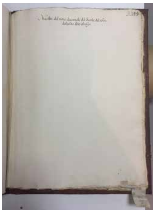
6. Baldinucci's, volume 4, inside part, detail

one thousand seventeen drawings should appear easier after having organized the more than eleven thousands sheets 39 he dealt with for the de' Medici 40 .