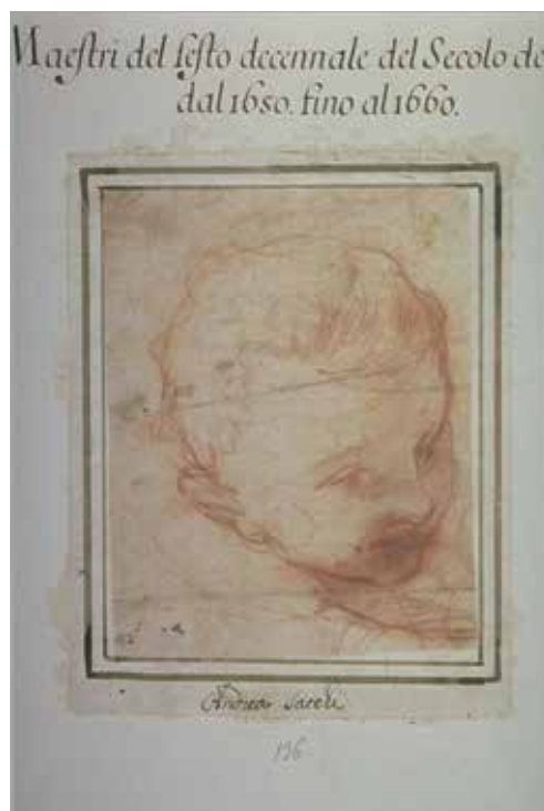
7. Andrea Sacchi, Head of a child, Paris, Musée du Louvre, département des Arts graphiques, Inv. 3829

While arranging the drawings of the de Medici's collection, Baldinucci wrote that: «[...] perché pareva a me, che questi cosi' fatti libri, ordinati per la successione de' tempi, fussero per avere un non so che della storia» 74 . Although the period and the conditions in which Baldinucci gathered his collection are not known 75 , the expression «un non so che della storia» 76 might correspond to his personal vision of the evolution of the art of drawing that he shaped, among other things, by going through his volumes again and again.