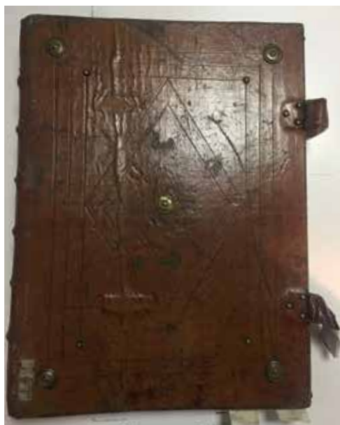
1. Baldinucci's binding, volume 4

Since then, art historians have debated the attributions given by Baldinucci passing over their original position in the volumes, as did as well the author of the present contribution during the preparation of the catalogue raisonné of the Genoese drawings held in the Louvre 6 . The still accepted opinion by Baldinucci on some sheets related to Genoese masters seemed, however, so puzzling that, in order to clarify the Florentine collector's approach to this regional school 7 , I decided to assemble the original sequence of drawings in each volume (fig. 3) 8 . The reconstruction has helped indeed in giving some explanations on this issue. It has also raised many general