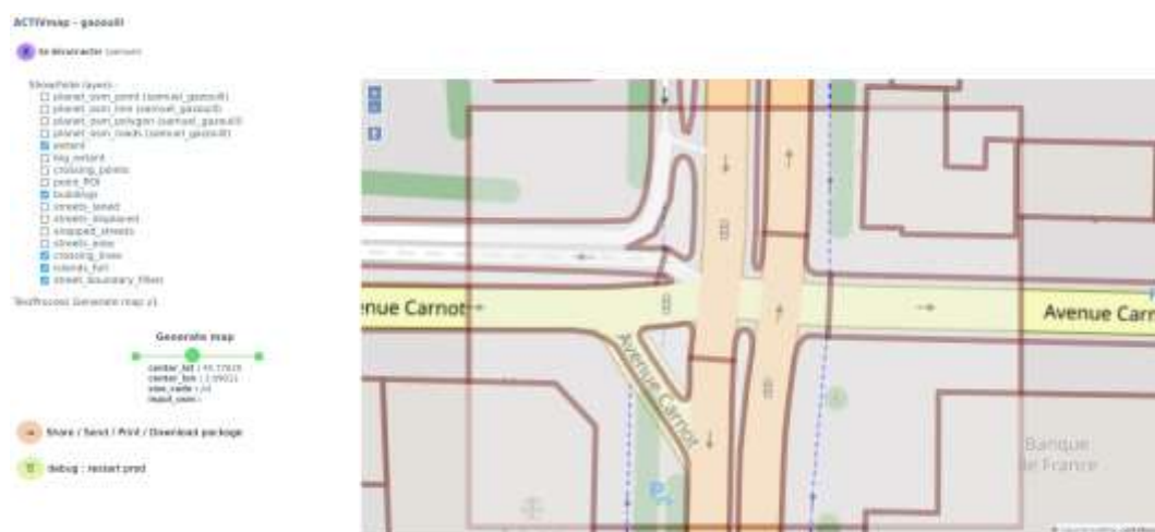
Figure 3. Capture of MULTIMAGE, with a map canvas and possible actions to trigger on the right with the list of layers.

The interactive actions are possible using the map interface presented in Figure 3. As a classical web GIS tool, the edition of the geometry and the semantics of the OSM data will be possible in the second step, and the edition of style as well as manual generalisation operations will be possible in the third step. Regarding the automatic scripts, several are already implemented in the platform. For instance, there is a script to segment and enrich the crossroad with important features such as traffic islands (Favreau & Kalsron, 2022), and a script to generate styles adapted to an audio-tactile map (Jiang et al., 2021). The backend, i.e. the server side of the platform is implemented in Python, using open source libraries such as GeoDjango and Geopandas. The web interface is developed in Javascript, based on the OpenLayers library. Data are stored using PostGIS, and the Web Feature Services displayed in the interface are generated with Geoserver.