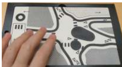
Figure 2. The DERi audio-tactile tool (Brocket al., 2012) with swell paper on top of an interactive tablet.

The interactive actions are possible using the map interface presented in Figure 3. As a classical web GIS tool, the edition of the geometry and the semantics of the OSM data will be possible in the second step, and the edition of style as well as manual generalisation operations will be possible in the third step. Regarding the automatic scripts, several are already implemented in the platform. For instance, there is a script to segment and enrich the crossroad with important features such as traffic islands (Favreau & Kalsron, 2022), and a script to generate styles adapted to an audio-tactile map (Jiang et al., 2021). The backend, i.e. the server side of the platform is implemented in Python, using open source libraries such as GeoDjango and Geopandas. The web interface is developed in Javascript, based on the OpenLayers library. Data are stored using PostGIS, and the Web Feature Services displayed in the interface are generated with Geoserver.