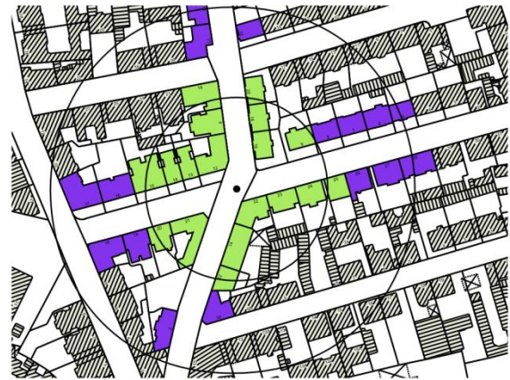
Figure 2. Detection of buildings as potential landmarks, (Elias, 2003)

Deep learning techniques can help with the detection of multi-scale anchors. To demonstrate this potential we trained, in a first experiment, a U-Net segmentation model to detect cities in maps. As input we gave the model tiles cut from an IGN map. The training set was automatically generated from a vector multi-scale database. We trained two different models at two different scales. Figure 3 shows that the model prediction matched well the mask (the expected answer). Although specific to our data, these results were encouraging.