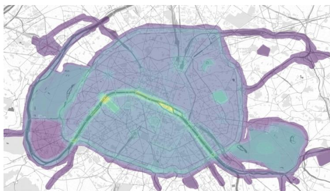
Figure 4. Landmarks heatmap produced with data issued from our drawing tool, Paris

Then we want to distinguish multi-scale anchors from simple landmarks by highlighting their multi-scale properties. The first approach will be to create one model for each scale and then try to match their results using data-matching techniques. The aim is to verify if two detected objects at different scales correspond to the same real-life object or not. An alternative approach is to give data from different scales to a single model and allow it to make the correspondence between scales.