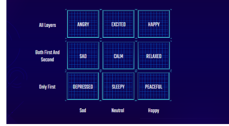
Fig. 1. Strategy/Layer/Emotion model, with the 9 pre-defined emotions based on the arousal/valence emotion model

The emotion model is designed as a server receiving control information from the game, in order to be able to work with various games and game values models. The game play information (events) emitted by the game may be about the game situation, player(s) situation, but also from various other