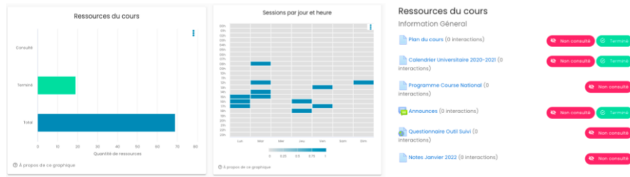
Fig. 1. Examples of visualizations in the NMP plug-in