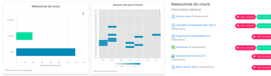
Fig. 1. Examples of visualizations in the NMP plug-in