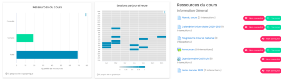
Fig. 1. Examples of visualizations in the NMP plug-in