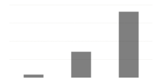
Figure 2 Fewer compounds denoting humans

Out of the 1028 nouns denoting humans, 768 are complex. Among those, relatively few are compounds, which is illustrated in the following figure.<sup>5</sup>