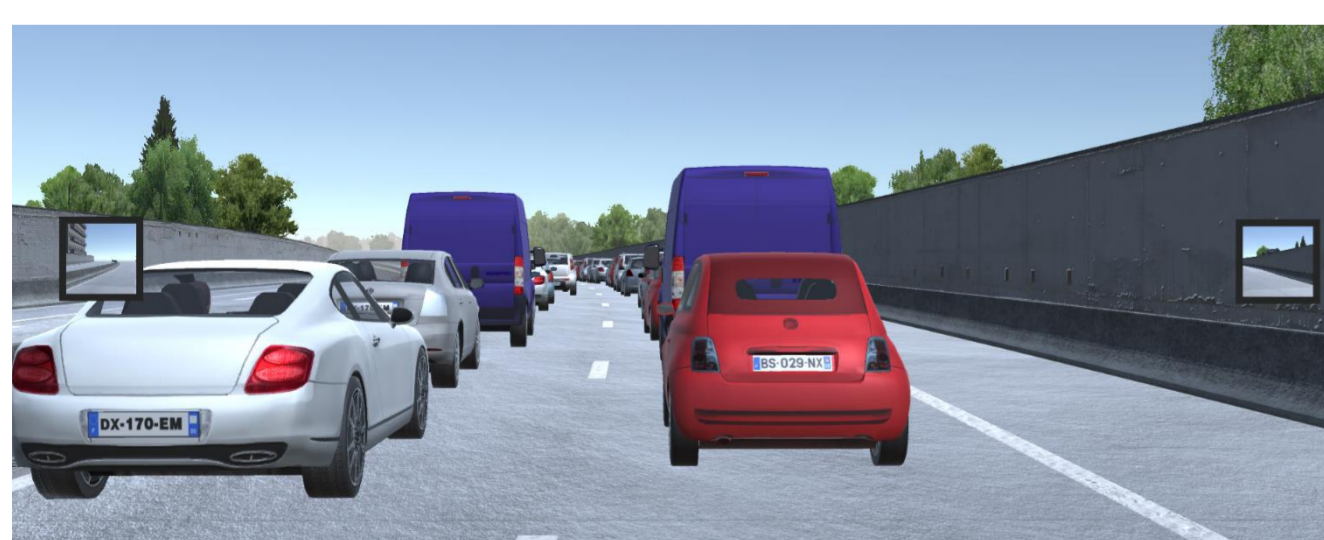
Simulated traffic jam of standard vehicles

23 participants (20 men, 3 women) rode twice on a heavily congested virtual 2 x 2 urban ring. The traffic jam consisted either of human-driven ("standard") vehicles or fully automated (SAE level 5) vehicles, moving at an average speed of 7.2 km/h. The participants were instructed to ride as they usually would. The order of exposure to both variants was counter-balanced between the participants.