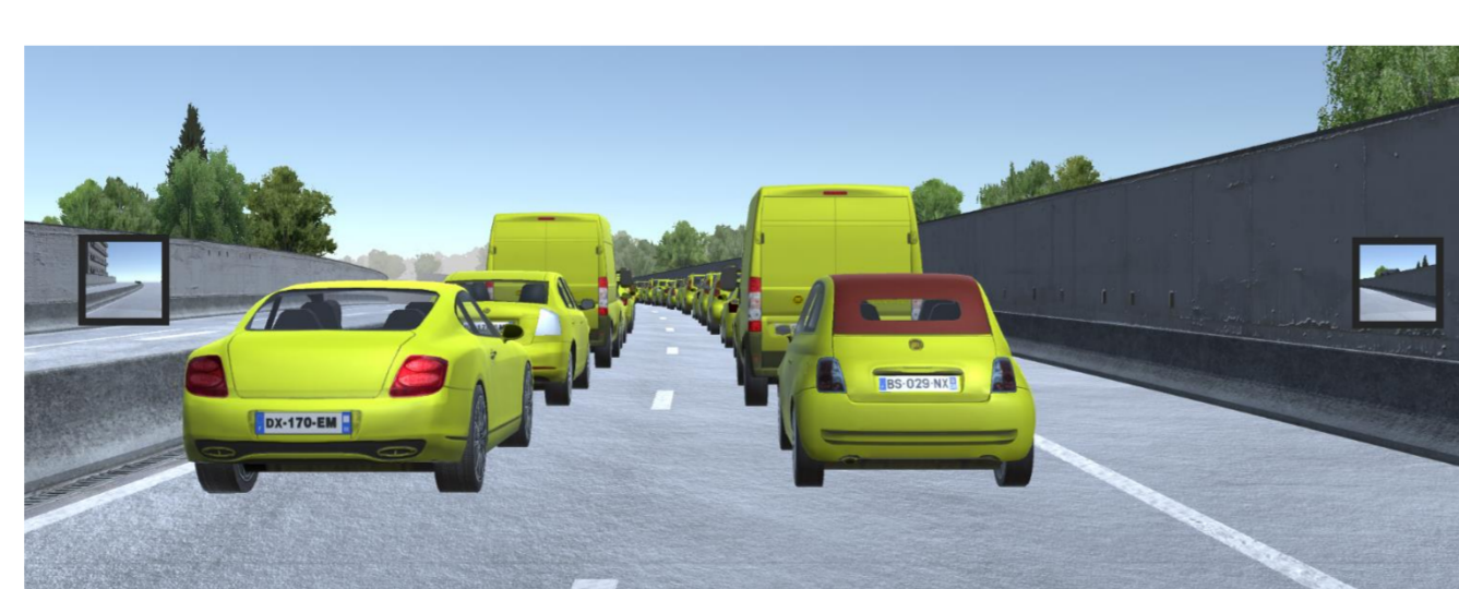
Simulated traffic jam of automated vehicles

The traffic simulation reproduced the behaviors observed in human drivers: variable lateral positioning, with some of them behaving empathically (i.e., "opening the way" for PTW riders practicing lane-splitting).