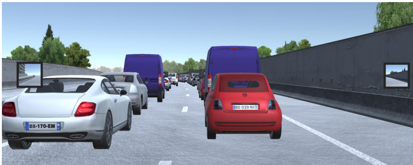
Simulated traffic jam of standard vehicles

We chose to signal the AVs and make them easily identifiable using their unique yellow color . 23 participants (20 men, 3 women) rode twice on a heavily congested virtual 2 x 2 urban ring. The traffic jam consisted either of human-driven (“standard”) vehicles or fully automated (SAE level 5) vehicles, moving at an average speed of 7.2 km/h. The participants were instructed to ride as they usually would. The order of exposure to both variants was counter-balanced between the participants.