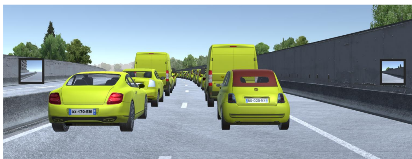
Simulated traffic jam of automated vehicles

The traffic simulation reproduced the behaviors observed in human drivers: variable lateral positioning, with some of them behaving empathically (i.e., “opening the way” for PTW riders practicing lane-splitting).