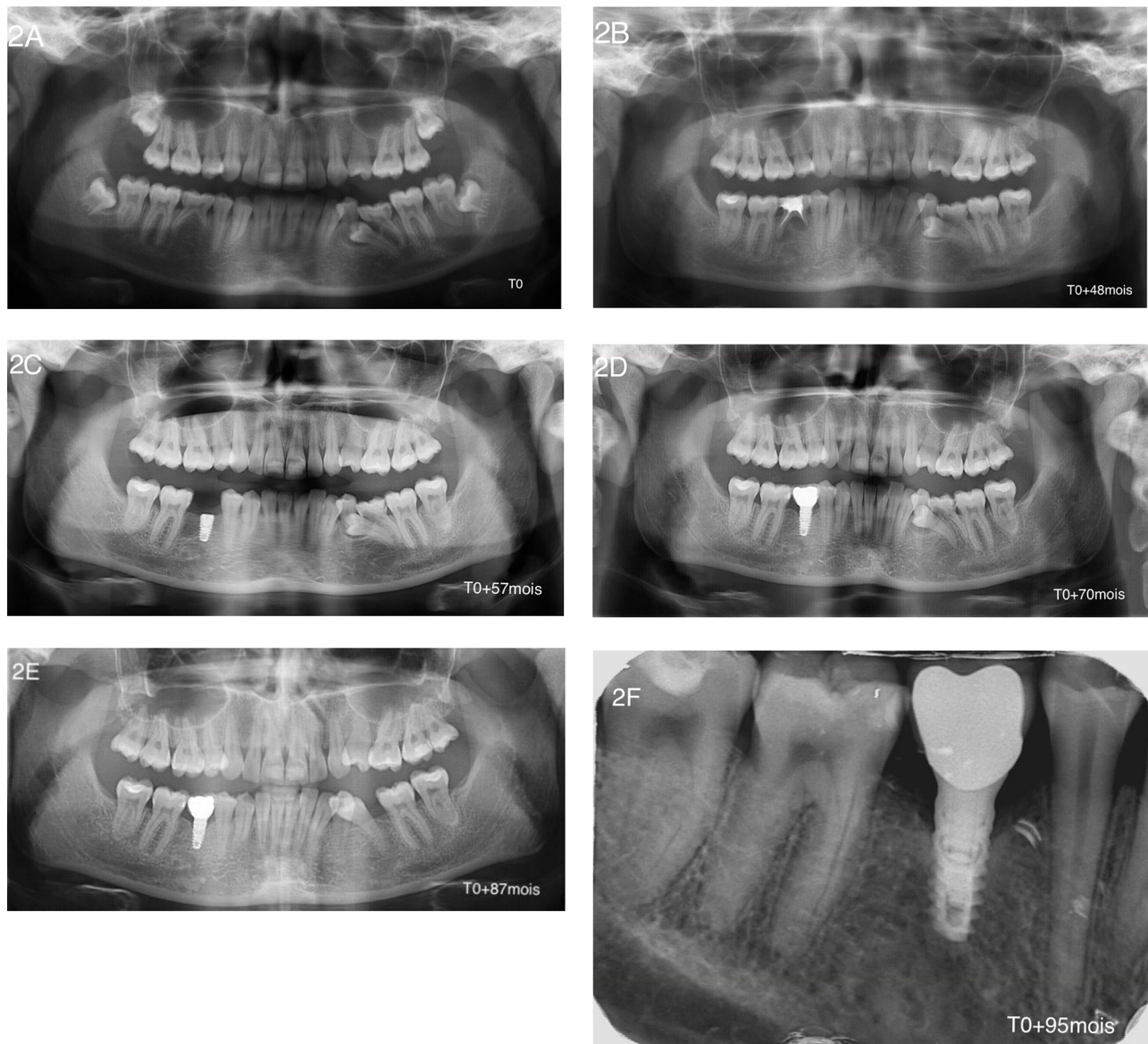
Fig. 2. Patient A; 8 years after radiological follow-up. (A) Initial panoramic X-ray. Agenesis of the upper first premolars and second lower right premolar, delayed eruption of tooth 35, remaining teeth 75 and 85, unerupted 4 wisdom teeth, and follicular cyst involving tooth 38. (B) Panoramic X-ray after 48 months of follow-up. Tooth 85 presented a periapical lesion. This chronic infection required tooth extraction. (C) Panoramic X-ray after 57 months of follow-up. Two months post-implantation (XiveS*, 3,8*8 mm, Dentsply-Sirona, Mannheim, Germany) for replacement of tooth 45. (D) Panoramic X-ray after 70 months of follow-up (1.5 years after implantation). Peri-implant bone level stability and successful osteointegration. (E) Panoramic X-ray after 87 months of follow-up (29 months after implantation). Peri-implant bone level stability and successful osteointegration. Tooth 35 was erupting in good position. (F) Retroalveolar X-ray after 95 months of follow-up for implant 45 (3 years post-implantation). Peri-implant bone level stability under the level of the first thread.

osseointegration of this implant, thereby allowing the placement of an abutment and a ceramic-metallic crown 4 months thereafter (Fig. 2C). Radiological monitoring showed bone-level stability at 29 months post-implantation (Fig. 2E). At T0+6 years, acute pulpitis encouraged the decision to perform emergency extraction of tooth 75 (Fig. 2D). Following the extraction of tooth 75 and after a thinking period the patient wanted to resume orthodontic treatment with the use of removable appliance in order to obtain orthodontic movement of tooth 35 onto the arch (Fig. 2E).