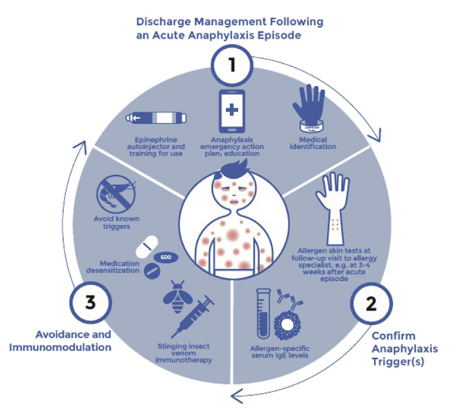
Fig. 5 Long-term management of anaphylaxis

Despite intramuscular epinephrine (adrenaline) being the first-line drug recommended to treat anaphylaxis, its use remains suboptimal.<sup>22,47</sup> The dose recommended for use by healthcare professionals is 0.01 mg/kg of body weight, to a maximum total dose of 0.5 mg, given by the route<sup>1,2,29,86</sup> intramuscular and may be simplified as shown in Table 6. Dosing should be repeated every 5-15 min if symptoms are refractory to treatment. Epinephrine administered by the intramuscular route is generally welltolerated.<sup>87</sup> This is in contrast to the intravenous