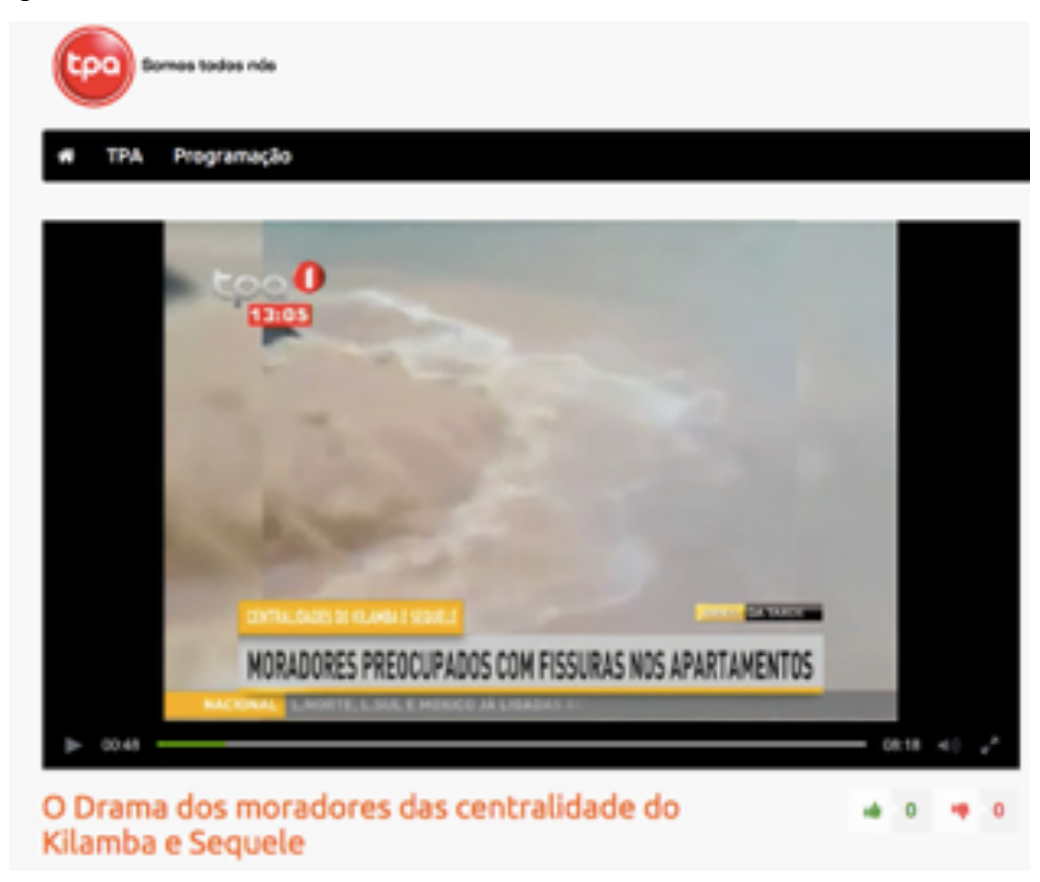
Figure 3: National television report: 'Residents concerned with cracks in the apartments'

The 8-minute-long report is damning. The long lines of people waiting to submit their application to access a flat in 2013 became lines of dissatisfied residents lodging complaints over the maintenance of their buildings. What happened to the enthusiastic response of the 'afro-optimist' observers who celebrated the emergence of Angola new middle-class?