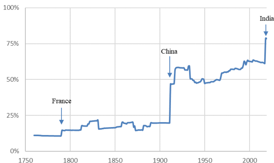
Figure 1. Proportion of the world population living in a country where homosexual acts are not criminalized, 1760-2020

Note: As of January 1, 2020, 79% of the world's population lives in a country that does not criminalize homosexual acts, compared to 63% in 2000, 20% in 1900, 16% in 1800 and 11 % in 1760.