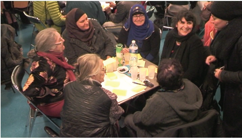
Figure 4. Informal discussion at small tables. Photo C. Dijkema, November 20, 2015.