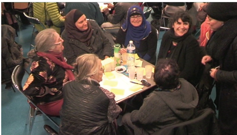
Figure 4. Informal discussion at small tables. Photo C. Dijkema, November 20, 2015.