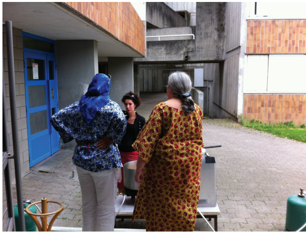
Figure 7. Members of the working group cook a shared dinner. Photo: C. Dijkema, June 10, 2016.

who are hostile to Muslim women wearing a veil (which is her case). One way for the moderator(s) to act on power relations is through distributing speaking time.