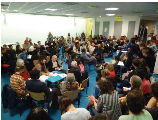
Figure 5. Plenary debate at the Salle Polyvalente des Baladins. People are seated both at small tables and on the steps. Photo C. Dijkema, November, 20, 2015.

of networks in the neighbourhood and beyond, and partly because the issues were framed in such a way that spoke to these different constituencies.