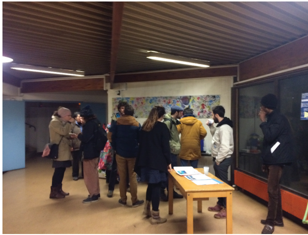
Figure 6. Informal discussion after a debate at La Cordée. Photo C. Dijkema, January, 22, 2018.