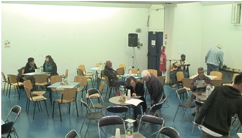
Figure 3. Small table configuration in the Salle polyvalente. March 11, 2016.

different subspaces allowed participants to go back and forth between the intimacy of small group configurations and the public nature of the plenary.