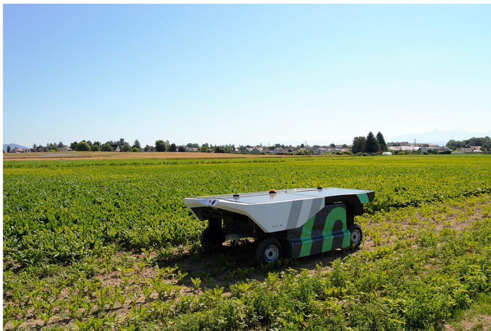
Fig. 1 Autonomous weeding machine (AVO) from ecoRobotix.