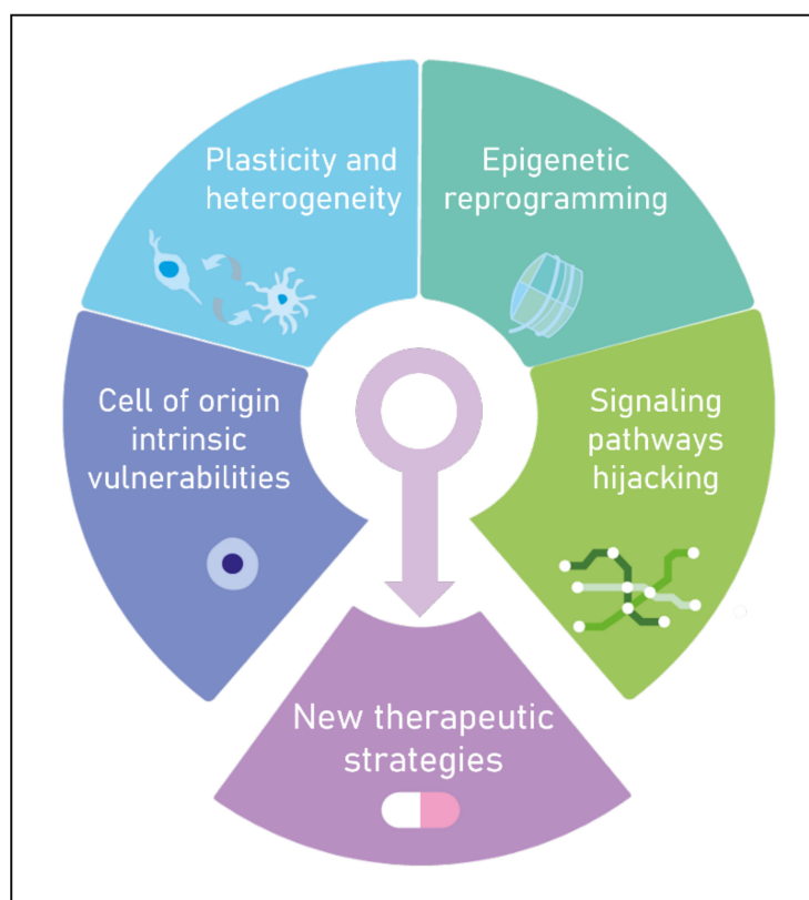
Figure 1. Elaboration of new efficient therapeutic strategies for pediatric high-grade gliomas will require the integration of the cell of origin intrinsic vulnerabilities, plasticity and heterogeneity, epigenetic reprogramming and signaling pathways hijacking.

In this review, we present an inventory of key molecular events associated with pHGGs occurrence and their importance in the stratification of the disease, focusing particularly on epigenetic components. We describe how the disruption of the epigenetic landscape in a specific permissive transcriptional context ultimately leads to pediatric gliomagenesis. In addition, we propose that transcriptional network alterations reflect the co-option of developmental processes and act in an intricate interplay with epigenetic rewiring to promote oncogenic properties. Finally, we illustrate the clinical relevance of this epigenetic/transcriptional crosstalk (Figure 1).