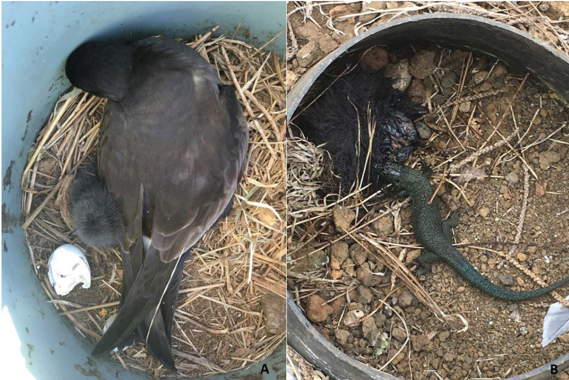
Figure 2. A) Monteiro's storm-petrel ( Hydrobates monteiroi ) in an artificial nest at Praia Islet with a recently hatched chick and remnants of eggshell. B) Madeiran wall lizard ( Teira dugesii ) eating a chick of Monteiro's storm-petrel in an artificial nest at Praia Islet.