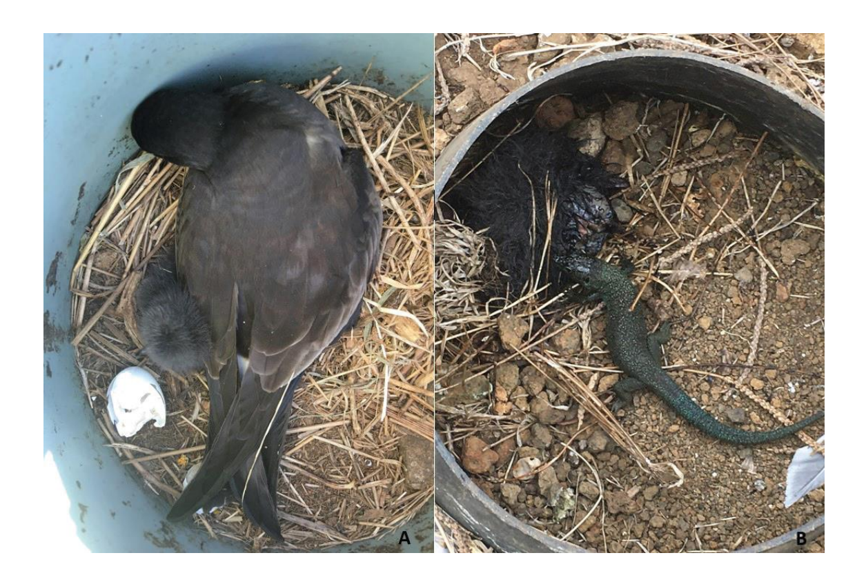
Figure 2. A) Monteiro's storm-petrel ( Hydrobates monteiroi ) in an artificial nest at Praia Islet with a recently hatched chick and remnants of eggshell. B) Madeiran wall lizard ( Teira dugesii ) eating a chick of Monteiro's storm-petrel in an artificial nest at Praia Islet.