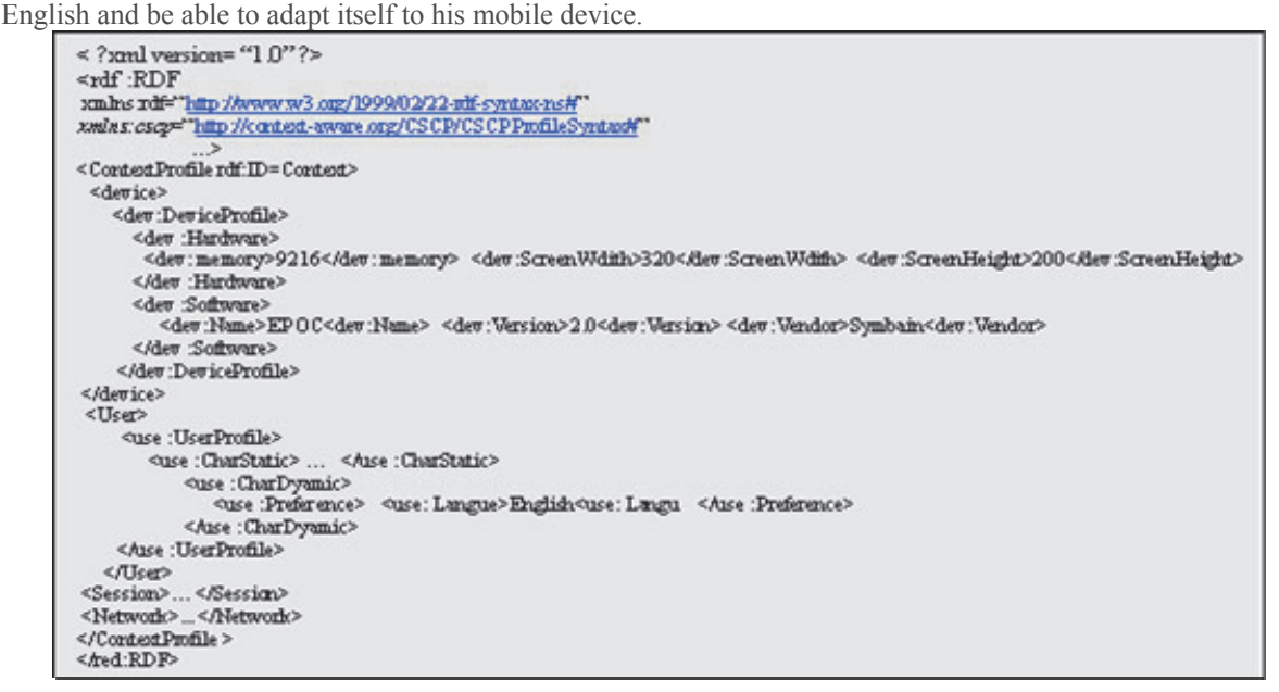
Figure.4. Example of CSCP profile in XML Format

The representation of the user and services context is demonstrated in figure 3. According to this format, our context profile is composed of a user profile, a session profile, a terminal profile and a network profile. Figure 4 presents an example of a service required by a user. This one wishes that the service sheds in