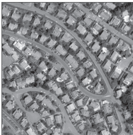
Figure 1. Original High resolution image

enable post-processing upon the images without referring to the image itself. So we can query these XML tags to extract the desired cartographic elements. Figure 3, shows an example of the tags. In this way, this independence is a great advantage.