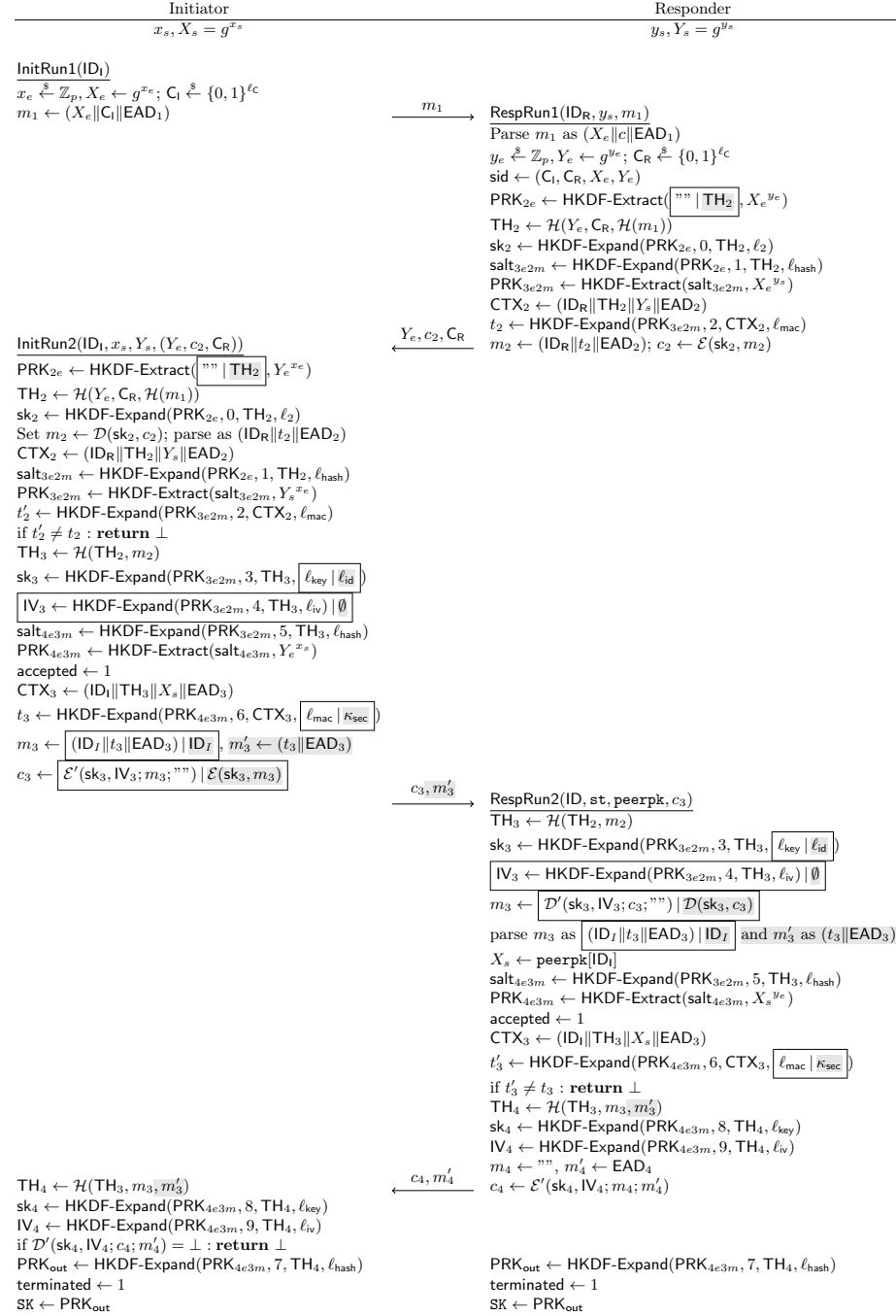
Fig. 3. Optimized EDHOC with four messages in the STAT/STAT Authentication Method. Our modifications compared to [SMP22] (draft-ietf-lake-edhoc-15) are represented by previous | new and additions by gray highlights