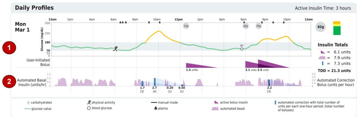
Figure 2. Automated Insulin Delivery Report: Page 2. 1, The top part of the daily profile displays the CGM tracing and is color coded to match the time in ranges bar (eg, green when in target range of 70 to 180 mg/dL, red when less than 70 mg/dL and gold when above 180 mg/dL). The user-entered carbohydrate is shown above the CGM tracing in gray circles and total amount of carbohydrates is shown on the bar right. Just below the glucose tracing is the amount of user-initiated bolus insulin in dark purple with the common “insulin sail” to show that active bolus insulin is available. 2, The lower section of the daily profile contains the automated basal insulin tracing in light purple with the left y-axis showing the rate in units/hour and the automated correction boluses delivered with the right y-axis showing units per hour. The total amount of correction boluses delivered in each 1-hour period of the day is shown by the thin blue line with the number of corrections in that hour shown in parenthesis below the total insulin amount. Total insulin amount for each day is shown on the right of each daily profile using icons to designate how the insulin was delivered along with the TDD.

iCGM and ACE pumps, will create an ecosystem of AID components that can be mixed and matched. Regulatory agencies across the world are reviewing this issue and we are confident that positive steps will be taken. Nevertheless, challenges will remain; thus, academic and corporate groups should continue working on a global interoperability standard.