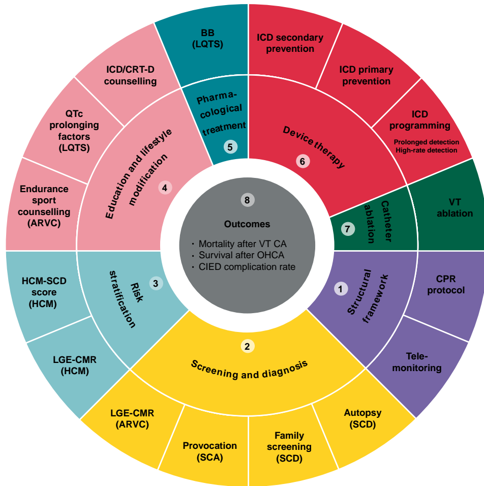
Figure 2 2022 ESC EHRA QIs for VA and SCD prevention. ARVC = arrhythmogenic right ventricular cardiomyopathy, BB = beta-blockers, CMR = cardiac magnetic resonance, CA = catheter ablation, CIED = cardiac implantable electronic devices, CPR = cardiopulmonary resuscitation, CRT-D = cardiac resynchronization therapy-defibrillator, DC = discharge, ESC = European Society of Cardiology, HCM = hypertrophic cardiomyopathy, ICD = implantable cardioverter-defibrillator, LGE = late gadolinium enhancement, LQTS = long QT syndrome, OHCA = out-of-hospital cardiac arrest, SCD = sudden cardiac death, VA = ventricular arrhythmia, VT = ventricular tachycardia.

externally validated and improves SCD risk prediction when compared with other prediction models. 27,28 Patients with a predicted 5-year risk of SCD \geq 6\% have the highest event rate and the most favourable risk-benefit ratio for ICD implantation. The use of the HCM-SCD risk score therefore forms a QI for the prevention of SCD in patients with HCM ( QI 03M01 ).