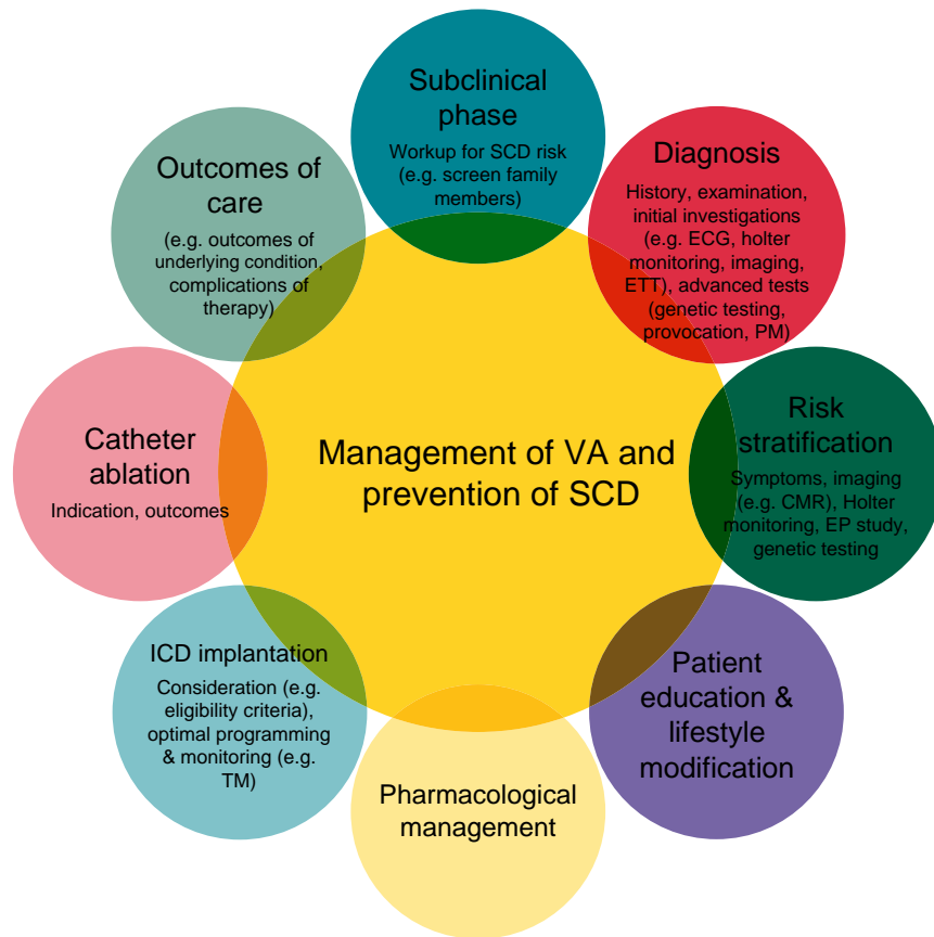
Figure 1 Conceptual framework for the management of patients with ventricular arrhythmia and sudden cardiac death prevention. CMR = cardiac magnetic resonance, ETT = exercise tolerance test, EP = electrophysiology, ICD = implantable cardioverter-defibrillator, PM = post-mortem, SCD = sudden cardiac death, TM = telemonitoring, VA = ventricular arrhythmias.

arrest team that delivers a prompt and high-quality cardiopulmonary resuscitation according to the European Resuscitation Guidelines is an indicator of care quality for SCD prevention ( QI 01M01 ). 20