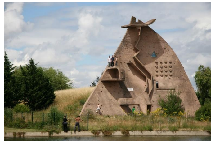
Dame du Lac, Evry