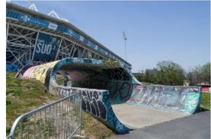
BigO skate park, Montréal