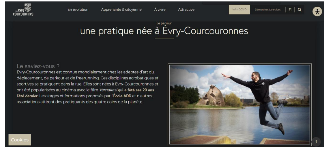
Evry city's official website