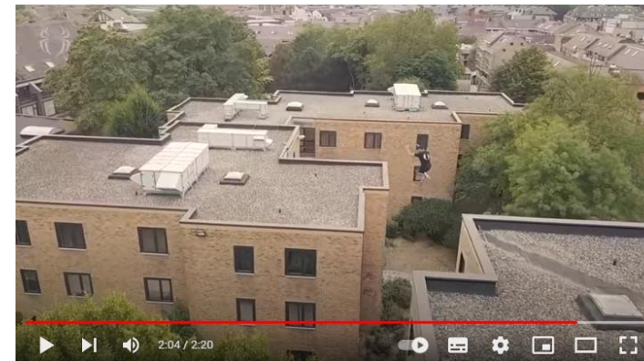
Roof gap, Louvain- la-Neuve