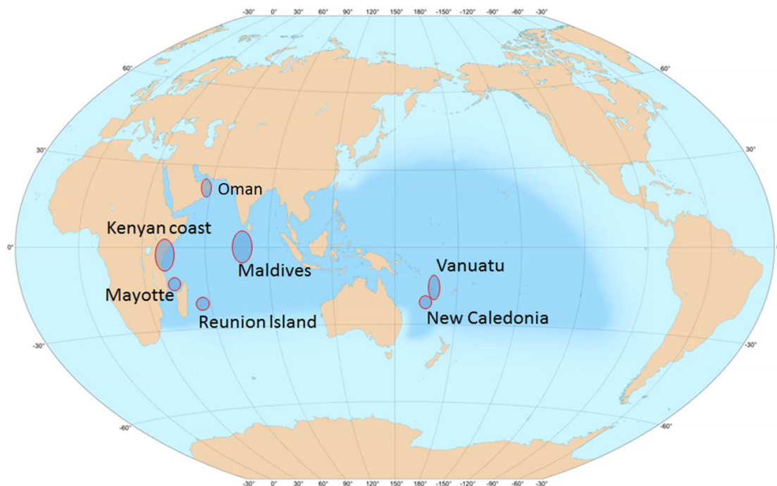
Figure 2. Location of field study sites (red circles) in the Indo-Pacific domain (darker blue). Map from Eric Gaba (CC-by-sa), Winkel Tripel projection.

Based on marginal tuberculation, all other Indian Ocean Protoreaster specimens from MNHN (MNHN-IE-2014-476, MNHN-IE-2014-1250, MNHN-IE-2014-1251, MNHN-IE-2014-1245, MNHN-