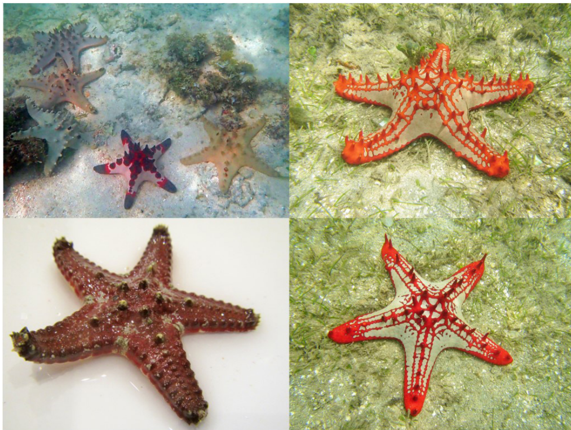
Figure 1. Comparison between Protoreaster nodosus (top left, 5 specimens from Vanuatu displaying color pattern variation, diameters around 25 cm), P. lincki (top right, diameter 20 cm), a juvenile P. lincki (bottom left, diameter 8 cm), and a P. lincki without superomarginal tubercles (bottom right, diameter 25 cm). All specimens were located at Mayotte Island.

colors (be it by drying or conservation in ethanol or formalin), and are hence harder to tell apart. They are mostly distinguished by the presence in P. lincki of lateral tubercles on both side of the arm tips, on the distal superomarginal plates (from 0 to 7 per side). However, these tubercles can be reduced or even absent in some specimens, even at a mature stage (as in Fig. 1). Döderlein (1936) seemed unaware of this variation. P. nodosus generally bears larger and more conical tubercles, which are sometimes restricted to the five primary radial plates, and are usually in only one, carinal, row outside the disc. For both species, the abactinal tubercles shape can range from rounded bumps to elevated spines: they are always bumpy in young specimens and can taper or not with growth. However, P. lincki seems to have more often tapered tubercles. Both species have a similar size and shape: P. lincki is usually described with a ratio of arm length (R) to disc ray (r) of R=2.3\sim 3r , and P. nodosus R=2\sim 3r (Marsh & Fromont 2020). Juveniles of both species are inconspicuous and nearly indistinguishable, both flattened, dull-colored with only 5 central short, blunt, bumpy tubercles at early stages. They both superficially look rather like P. nodosus (or even some goniasterids, despite extensive papular areas), which may cause confusion. Juvenile oreasterids are known