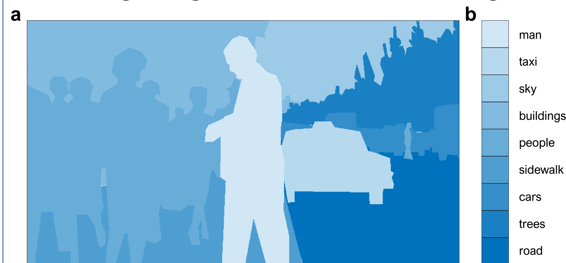
Figure 3. Objects within critical frames were (a) manually segmented and (b) labelled using MATLAB's Image Labeler app.