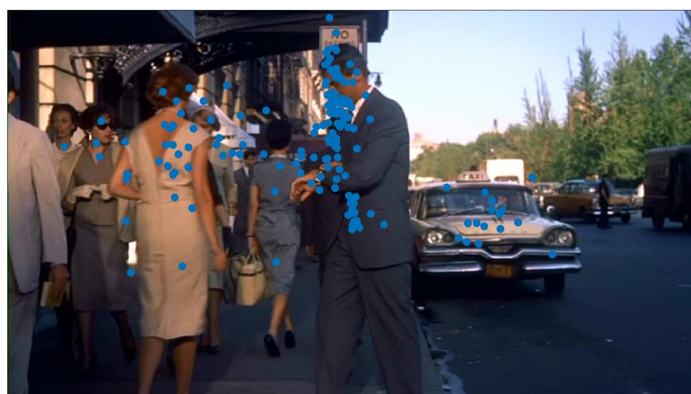
Figure 2. Analysis was restricted to fixations on objects within critical frames.