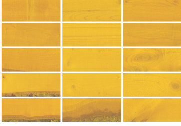
Figure 2: Timbers textured wood samples [32]. Each column illustrates some samples of one texture class [ https://sites.uef.fi/spectral/spectral-image-database-of-nordic-sawn-timbers/ ].

quantization level for this dataset is set to 256 .