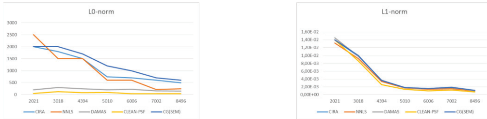
Figure 1 – Evolution of criteria L0-norm (left) and L1-norm (right) over frequencies at a converge state (judged as such).

Not surprisingly, two groups of algorithms are identified. The first (view as a L2-norm class of algorithm) composed of CG (SEM), CIRA and NNLS (very close but with NNLS a little more sparse) and DAMAS (even more sparse) and the other group (view as a L1-norm class of algorithm) composed of Clean-PSF which provides the sparsest maps (often impossible to visualize). The degree of sparsity is observed with criterion L0 which always decreases for the first group and always increases for the second, as expected. Thus, CG(SEM), CIRA and NNLS find a variable number of sources depending on the frequency. This is not the case for DAMAS and Clean-PSF (see Figure 1).