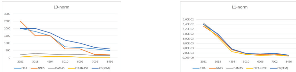
Figure 1 – Evolution of criteria L0-norm (left) and L1-norm (right) over frequencies at a converge state (judged as such).

Not surprisingly, two groups of algorithms are identified. The first (view as a L2-norm class of algorithm) composed of CG (SEM), CIRA and NNLS (very close but with NNLS a little more sparse) and DAMAS (even more sparse) and the other group (view as a L1-norm class of algorithm) composed of Clean-PSF which provides the sparsest maps (often impossible to visualize). The degree of sparsity is observed with criterion L0 which always decreases for the first group and always increases for the second, as expected. Thus, CG(SEM), CIRA and NNLS find a variable number of sources depending on the frequency. This is not the case for DAMAS and Clean-PSF (see Figure 1).