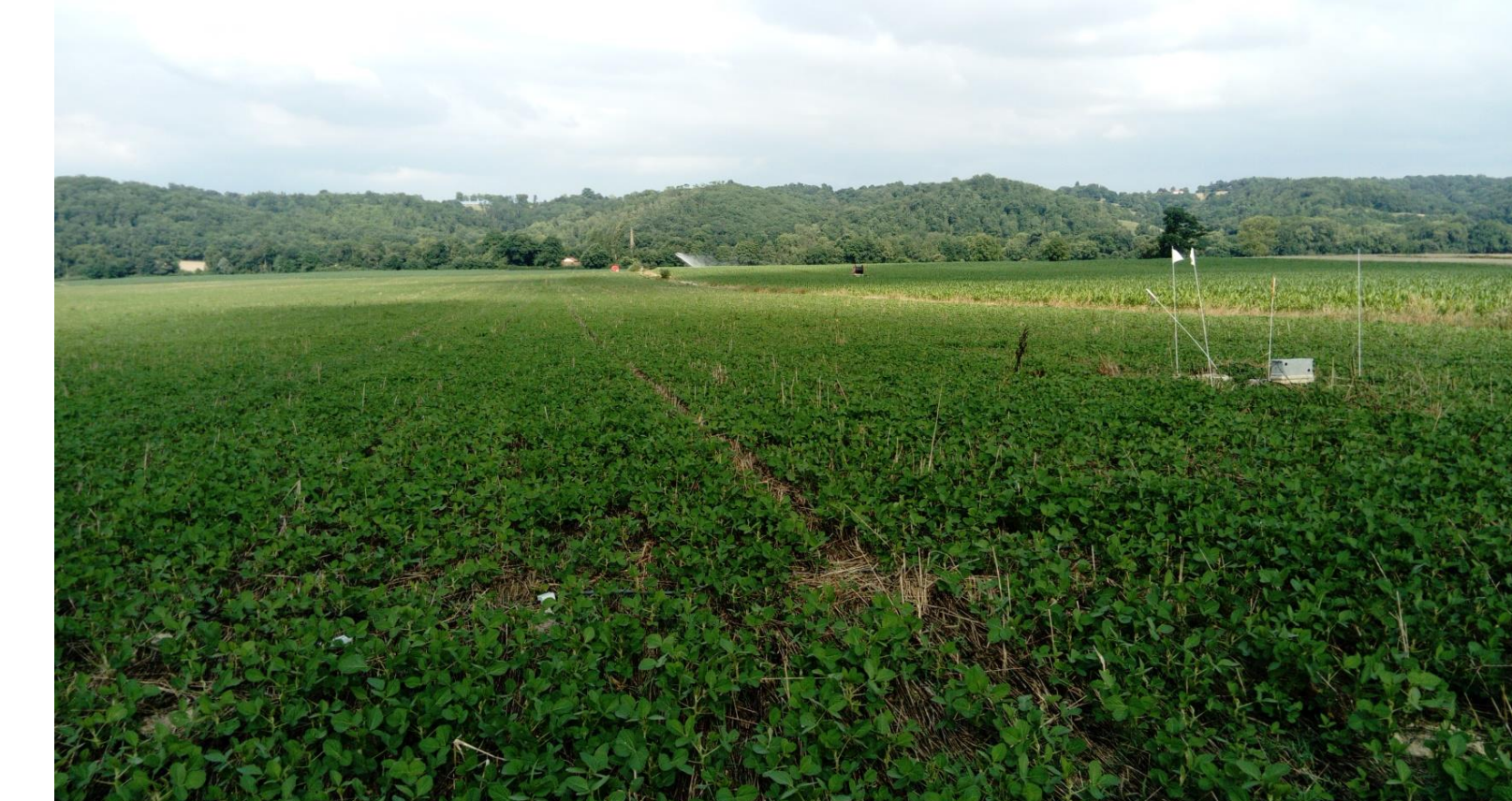
Field under conservation agriculture practices