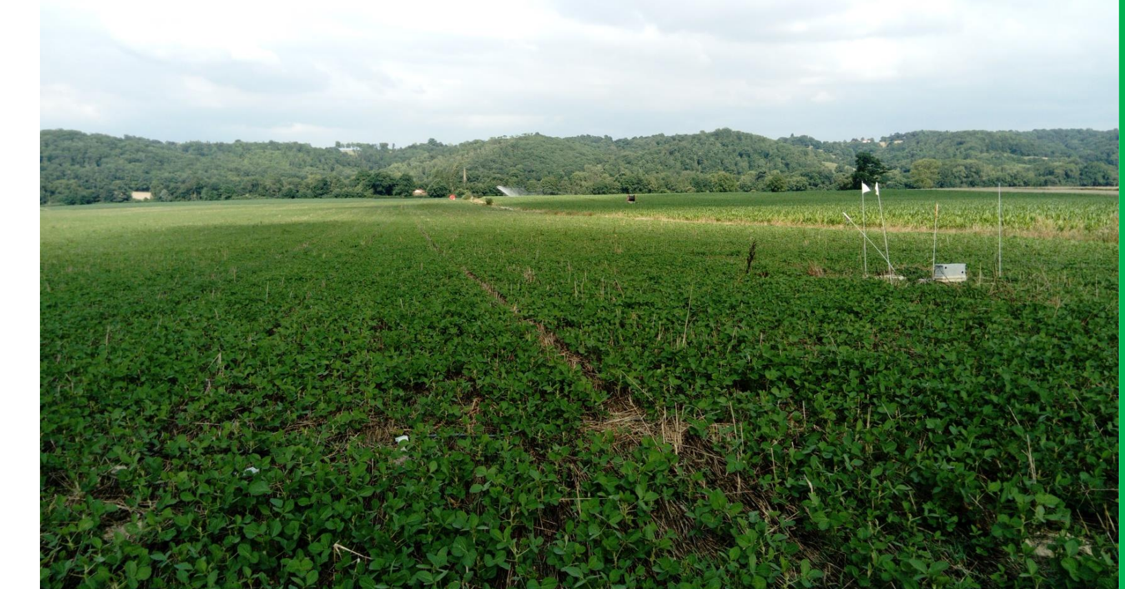
Field under conservation agriculture practices