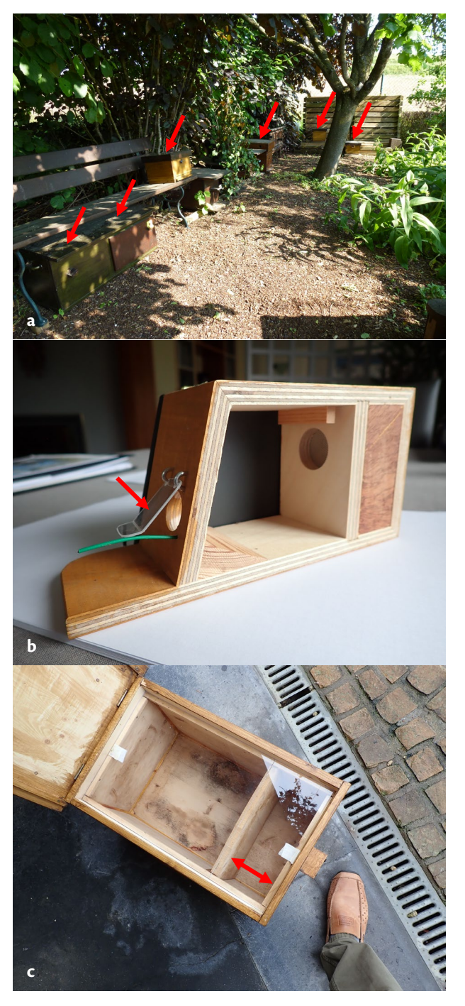
Figure 1. Photos of experimental setups. a. Wooden boxes with bumblebee nests (arrows) in a garden. b. Airlock apparatus with its plastic lid (arrow) covering the 'exit'. c. Empty wooden box with an additional chamber (arrow).