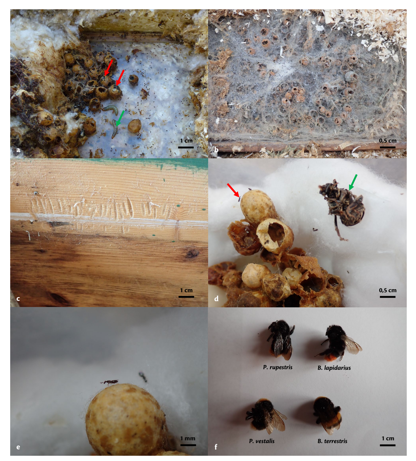
Figure 2. Photos of A. sociella ( a – c ), M. acasta ( d – e ) and Psithyrus spp. ( f ). a. Combs destroyed by A. sociella larvae (green arrow) and dead nonemerged bumblebees (red arrows). b. Web of silk and frass produced by A. sociella larvae. c. Wooden box gnawed by A. sociella larvae. d. M. acasta adults on bumblebee combs (red arrow) and decaying bumblebee pupae (green arrow) extracted from its M. acasta larvae-infested comb. e. M. acasta female on a bumblebee comb. f. Bombus spp. queens and their associate Psithyrus spp. female inquilines.

preventing techniques), 8.26 %, 1.53 % and 3.67 % of the colonies were visited by Aphomia sociella , Melittobia acasta and Psithyrus spp., respectively.