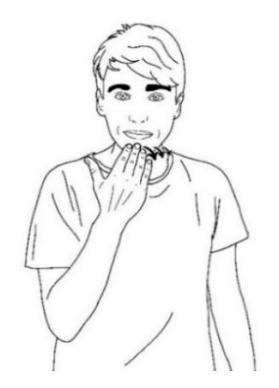
Figure 2. the sign NOCH-NICHT (not yet)

Where has it been said that it was one thousand? Where has it been said? This has not been said?