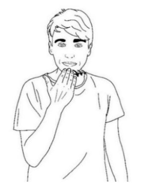
Figure 2. the sign NOCH-NICHT (not yet)

WO GEBÄRDEN EIN-TAUSEND WO. NOCH-NICHT GEBÄRDEN NOCH-NICHT Where has it been said that it was one thousand? Where has it been said? This has not been said?