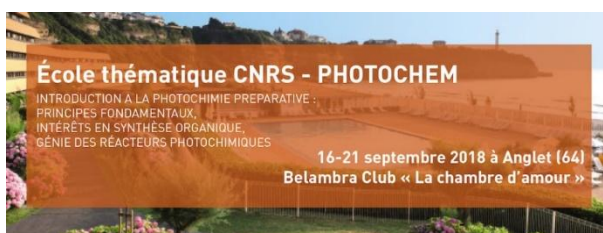
Figure 1. Logo of the CNRS-Summer School PHOTOCHEM.