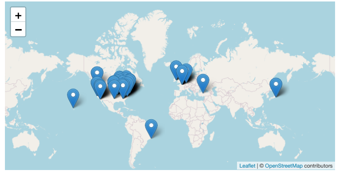
Fig. 1. Node distribution of the primary cluster.

The EdgeNet@home testbed has just been inaugurated, and is relatively small. We deliver ODROIDS 5 to those who would like to support research on EdgeNet@home by hosting this