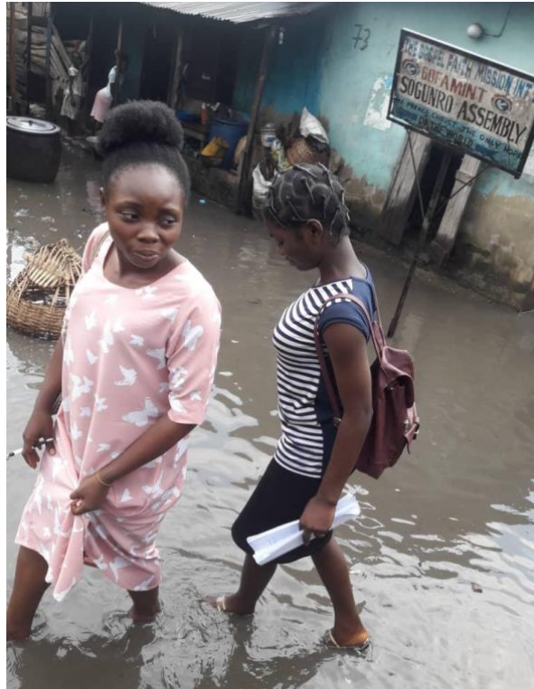
Figure 1 : Flooded Scene at Iwaya slum

portion of them ill. (Abdi et al. 2018, 2; Ssemugabo et al. 2021, 2). Ige and Nekhwevha (2014) stated that the overall living conditions in coastal slums pose a threat to residents' ability to participate in the economy, their health, and their general well-being.