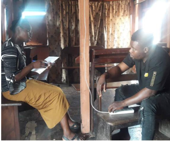
Fig 3: Researcher with a male respondent at Makoko