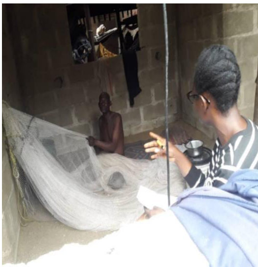
Fig 5: Researcher with a male respondent at Iwaya