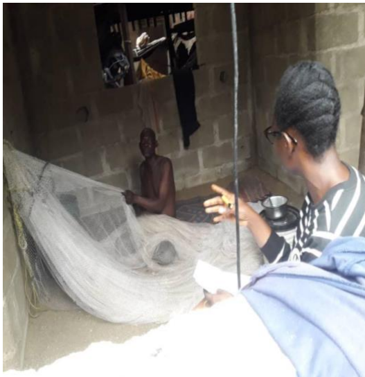
Fig 5: Researcher with a male respondent at Iwaya