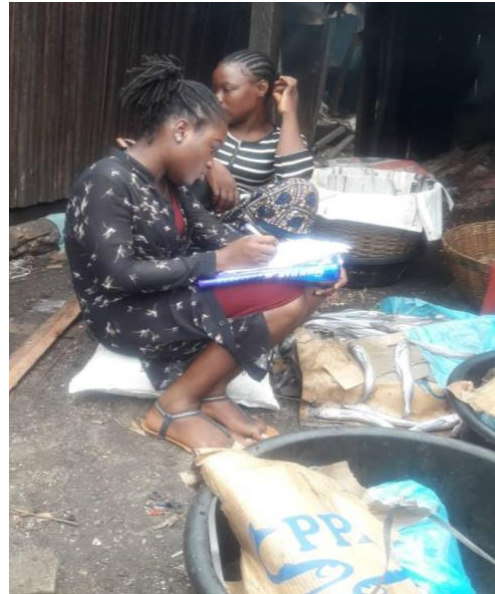
Fig 4: Enumerator with a female respondent at Makoko