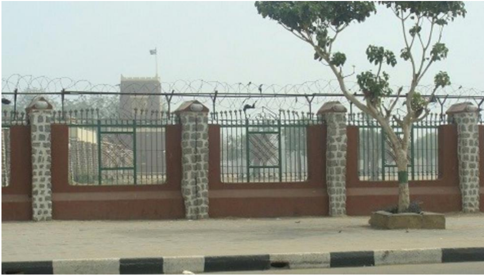
Fig. 5: The Interlocked Walkways around the Emir's Palace