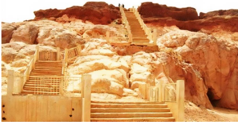
Fig. 3: Dala Image.

preservation and aesthetics of the hill. This effort further tallies with two main roles of landscape architects as earlier on mentioned which are; (1) the enhancement of environmental value with a view to implementing resource management policies and (2) to ensure the social context of landscapes (e.g visual, environmental, access/use, as well as heritage). In this sense therefore, landscape architects contributed in the preservation and transformation of the Dala Hill into resources management centre and cultural heritage site.