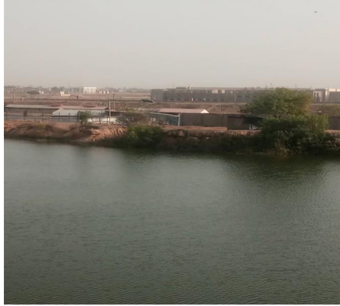
Fig. 4: Redeveloped Puddle in the Kano Capital City