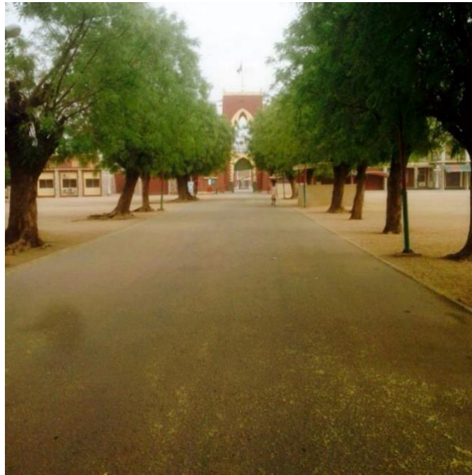
Fig. 2: Neem Tress Planted around the Kofar Kudu of the Emir's Palace

Said, 2013; Barau, Macnochie, Ludin and Abdulhamid, 2015). The State government together with various non-governmental organizations such as Kwandala Foundation and MTN therefore, introduced the famous greening of the city project not only for the challenges of climate change, but also for aesthetics (Fig. 2) (Bashir, 2017; Agency Report , 2020 and Murtala, 2021 ).