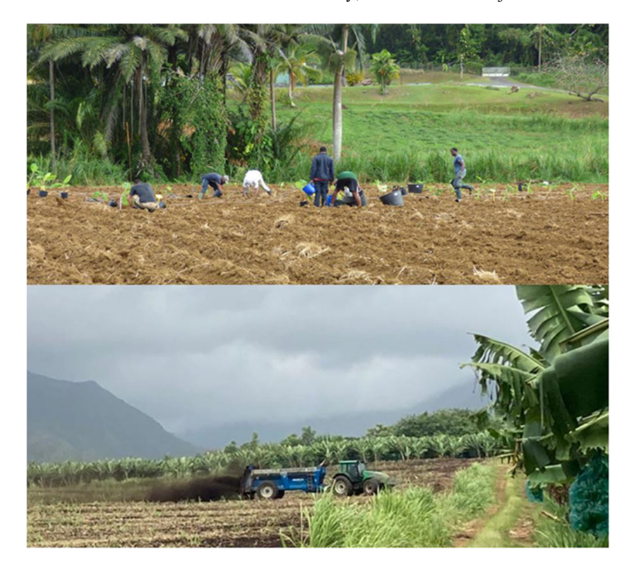
Fig. 1 Example of organic fertilization (including animal excreta) in banana plantation in Guadeloupe. This practice is mainly manual in small family farm with the excreta put directly in the planting hole (top picture, Credit: Madly Moutoussamy, INRAE). Mechanized material available (here in large banana farm) is not affordable/ adapted for small farms (bottom picture, Credit: Audrey Fanchone, INRAE).

At the farm level, several factors can affect the implementation of CLI practices, including amount of subsidies, decrease in input costs, level of farmer education, or lack of professional organizations (Fanchone et al. 2020). MCLS are widely perceived as having lower profitability and higher (and more skilled) labor requirements and upfront costs than specialized systems (Cortner et al. 2019). Quantitative (duration and frequency) and qualitative (arduousness and skill) features of work can limit CLI implementation (Ryschawy et al. 2012; Cortner et al. 2019), especially due to the presence of animals. Livestock management involves a very different pattern of work compared to crop activities: livestock work is done on a daily basis, and many tasks are not postponable (Hostiou and Dedieu 2012), which thus requires more labor and more skilled labor with person experienced with animals than extensive or completely mechanized crop systems (Cortner et al. 2019; Garrett et al. 2020). Efforts to promote the development of CLI also need to account for, in addition to the economic rationality, a number of subjective factors