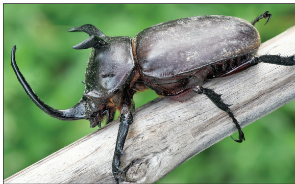
Fig. 3 Live male of Eupatorus siamensis (Castelnau, 1867) observed 4 km west of Kampot.

Tourism Site (CBET) in Kampong Speu Province (Fig. 1). These were collected using a UV-light trap in semi-evergreen forest during entomological training sessions focusing on Coleoptera as part of a collaboration between the Cambodian Entomology Initiatives (CEI) and the Illinois Natural History Survey in 2018. Our specimens of the species are distinguished from other members of the genus by their glabrous dorsa, their two divergent and non-spatulate thoracic horns, dark chestnut habitus, and the shape of their aedeagus (Prandi & Grossi, 2021) (Fig. 2).