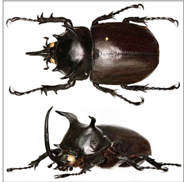
Fig. 2 Dorsal (above) and lateral habitus of Eupatorus siamensis (Castelnau, 1867) from Chambok Community-Based Eco-Tourism Site.

The observation of E. siamensis was made in the community protected area of the CBET, which forms part of the Cardamom Mountains. The CBET occupies a total