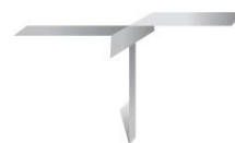
Figure 2. Helicopter

As part of the sequence of the 12 lessons on statistics the teacher introduced an adapted version of the paper helicopter activity originating from the work by Box (1992) who used it to teach experimental design to engineering students. The activity has also recently been used as a modeling activity involving conjecturing, experimenting, and evaluating 10-11-year-old students' ideas about statistical distributions (Kawakami, 2017). In the activity, the students were presented with a scenario to evaluate three competing designs of airdrop devices by conducting a small statical investigation of miniature replicas of the designs in terms of paper helicopters (see Figure 2). The aim for the students were to decide which helicopter (a) had the longest flying-time; and (b) which was the more accurate in terms of coming closets to the airdrop target – and also considering if difference in the loaded weight might influence the decisions. The class worked on the activity on and off during four consecutive lessons (lessons 6-9 in the sequence), whereby we will focus on the first two lessons.