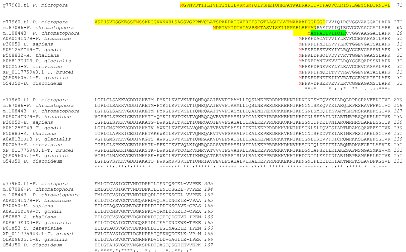
Figure 1 Alignment of the full-length ORFs encoding the 60S ribosomal protein L12 (RPL12A) from various organisms. The ORFs encoding ribosomal protein L12 were aligned with ClustalX2.1. The ORF sequences derived from gene models from the Viridiplantae Arabidopsis thaliana (At2g37190, P508832), the rhizarian Cercozoa causative agent of cabbage clubroot, Plasmodiophora brassicae (P508832) as the closest relative of Paulinellidae , Toxoplasma gondii (A0A125YT49), Homo sapiens (P30050), Saccharomyces cerevisiae (P0CX53), Trypanosoma brucei (XP_011775943.1), Euglena gracilis (QLA09605.1), Dictyostelium discoideum (Q54J50), the dinoflagellate Polarella glacialis (A0A813EJD3), and Paulinella micropora (g77960.t1). Both ORFs from P. chromatophora (m.87086 and m.108443) are derived from the transcriptome. None of the two corresponding L12 transcripts display the trans-splicing tag (CTTTCTG) and is therefore expected to correspond to a full-length transcript (nucleotide sequences of all P. chromatophora transcripts are available at https://www.ncbi.nlm.nih.gov/bioproject/PRJNA311736 ). The various in-frame start codons are colored in red. The numbering of the amino acid sequence is indicated on the right side in italics. The zone colored in yellow in Paulinella sequences shows significant divergence from the other otherwise very conserved sequences below. The N-terminal acetylated peptide sequence retrieved in this study is shown in green. NB PSI-BLAST of the N-terminal extension (137 residues) of P. micropora shows no homology with any known eukaryotic protein.